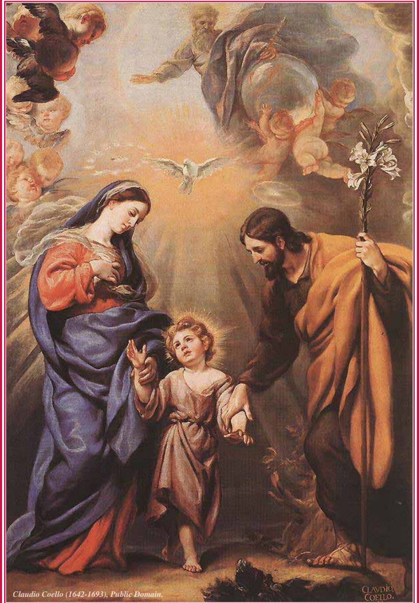
Claudio Coello (1642-1693), Public Domain.

As we celebrate the Holy Family at this sacred time of year, let us pray for their intercession, using the following prayer: