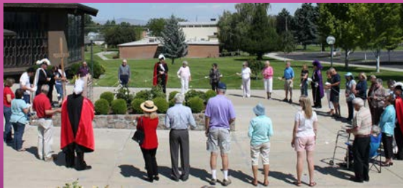
A Living Rosary for Life, sponsored by the Knights of Columbus, was held at Holy Family Church in Yakima on May 29. Participants formed a circle and held large "beads" of the rosary, taking turns saying the individual prayers.