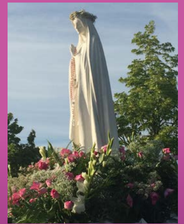
Parishioners from Our Lady of Fatima Parish in Moses Lake carried this statue of Blessed Mother, surrounded by flowers, in a procession around the church on May 13. It was all part of the Fatima Family Festival. Children who'd received their First Communion the weekend prior led the procession, dropping rose petals.