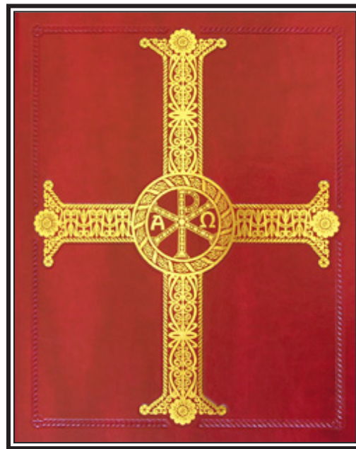
Cover of new Roman Missal, from Liturgy Training Publications

In the words of "Understanding the Revised