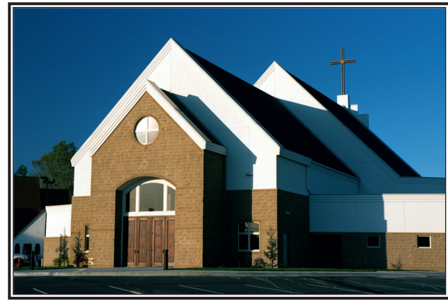
Many cultures and traditions come together at St. Joseph.