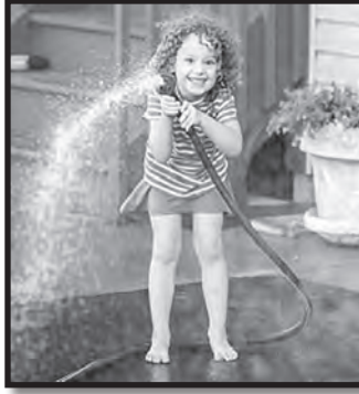
Since playing with water is a favorite summer activity, watch the temperature to protect children.

Water that has been sitting in a garden hose in the sun can reach 190 degrees Fahrenheit. That temperature is near boiling and can cause an instant burn upon making contact with skin — especially the more delicate skin of young children. Second- and third-degree